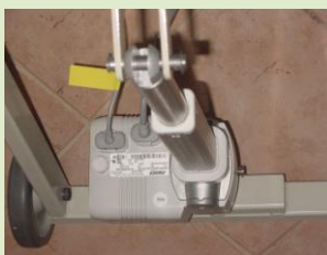
SKF Matrix 65, 8000N rapid motor