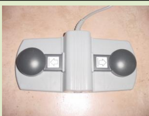
SKF Electric Foot pedal for motor