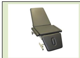
31" table width with elbow pads

Econo Osteo tables are entirely designed and fabricated in Quebec.