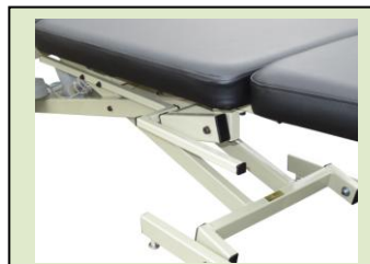
Control bar for height adjustment