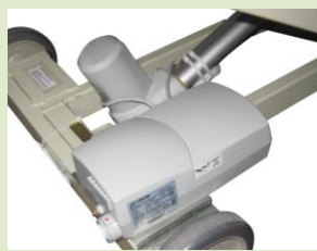
10,000N electric actuator

Econo Osteo tables are entirely designed and fabricated in Quebec.