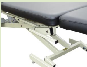
Control bar for height adjustment