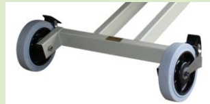
Ergo table (W) with lockable wheels