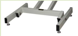
Ergo table (S) : Static/fixed work cell with levelling pads