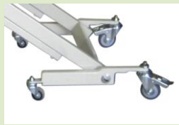
Ergo table (M) with multi directional wheels