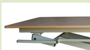
Control bar for height adjustment