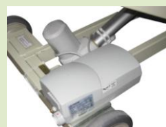
10,000N electric actuator

Techno Vogue Inc., tables are entirely designed and fabricated in Quebec.