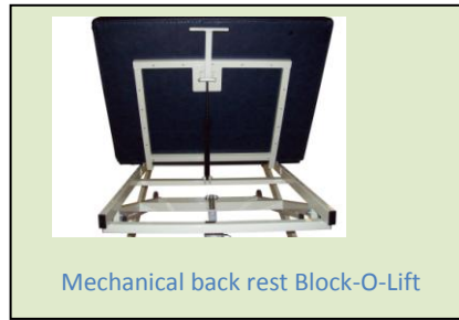
Mechanical back rest Block-O-Lift