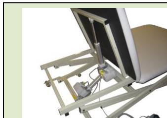
Optional electric back rest